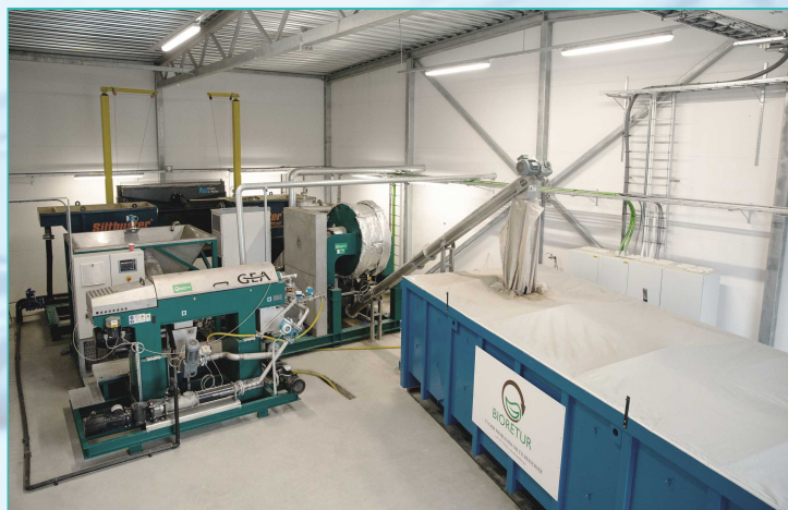
Photo showing installation of the award-winning FRS® Fish Sludge Recovery System operating at Erko Settefisk

This takes us a step further towards the potential for RAS, the ability to provide a controlled environment for fish farms, helping to meet 'circular economy' targets and tougher legislative controls, so maybe aquaculture can meet the global demand for fish without ruining the environment. Our partners, Bioretur AS took part in, and won the UK Aquaculture Sustainability Award and have already signed contracts with the top 3 salmon producers in the world: - Mowi, Grieg Seafood and Lerøy.