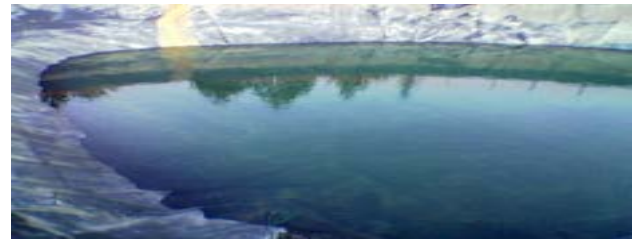
Final water holding tank. Water was tested prior to release to surface drinking water source