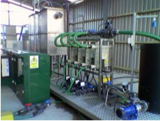
Installation of 4x electrochemical reactors and lamella plate separator