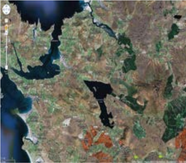
Bellanboy, County Mayo, Republic of Ireland