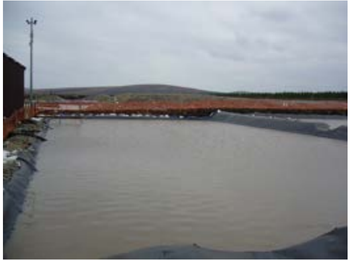
Tailing ponds created to collect all site runoff

The late Professor Philip Morgan (Inventor of Soneco® and Founder of Power & Water) at Shell Corrib Gas Terminal